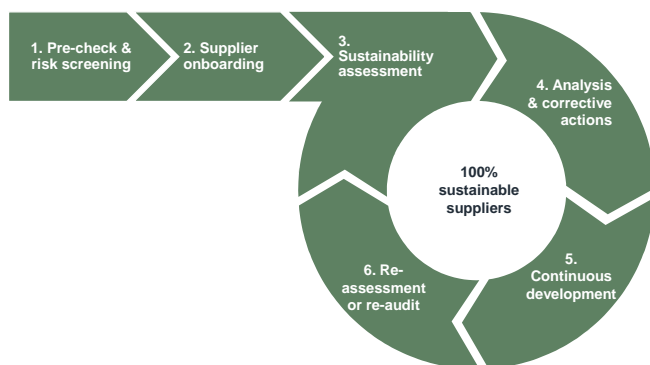
Figure 1: Gränges' responsible sourcing program

All Gränges' business units operate a local responsible sourcing program as outlined in in this policy and infographics below. The program covers all suppliers with an annual spend above 500 kSEK or equivalent amount in local currencies, and is used as a platform to enforce sustainable practices, reduce supply chain sustainability risks, ensure continuous improvements, develop collaboration, and build lasting supplier relationships.